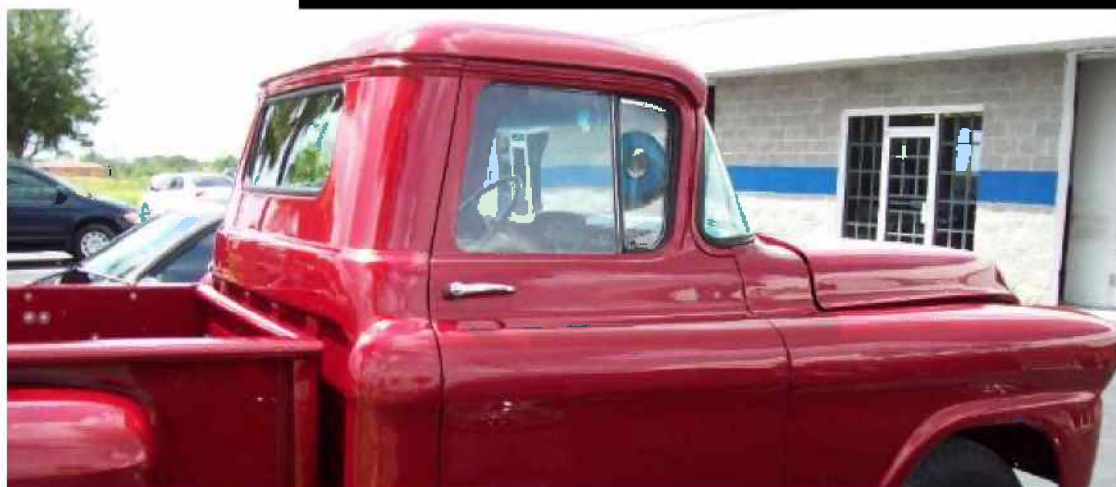
Just completed bodywork and paint on 1959 Chevy pick up